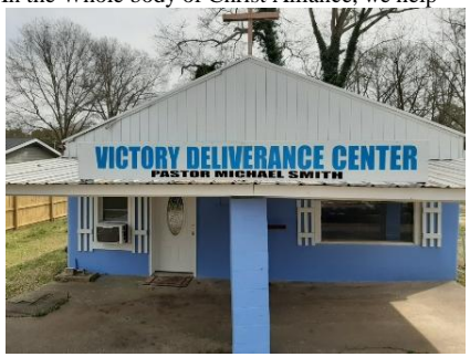
Victory Deliverance Center in Winder each other, not as much as we could, but we help each other. (see pg 4)

In the Whole body of Christ Alliance, we help