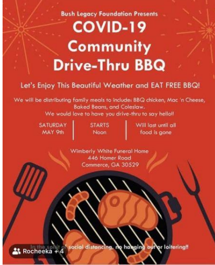
The advertisement from Wimberly White Funeral Home

Death is not comical, but sometimes real life is more comical than a comedy sketch. A covid-19 BBQ (that's enough to make you smile all by itself) scheduled to take place at a funeral home was cancelled due to death.