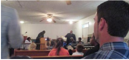
Praise and worship was intense

of need. When you get there, they are not going to be saved. They will have hurt, heartache, sickness, pain or addicted. But my God can do the impossible.