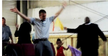
The people in worship

war. We have to remember who we are. The Holy Spirit said, 'Has opportunity created your position, or is it that relationship? With the relationship, opportunity doesn't matter; it is just a distraction. A new wine skin is a structure. Structure is good, but we do not want a spirit of religion.'