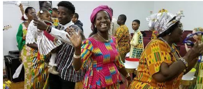
The offering dance

It was truly a blessing to see vessels care about one another enough to commit to make provision to see dreams come true.