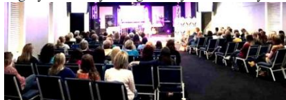
The women at the conference