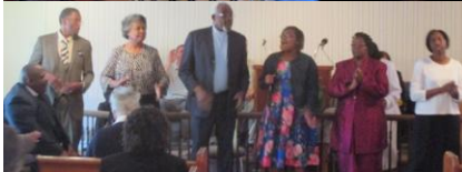
The Saint John Singers