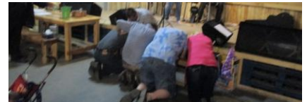
People praying at the altar for God's guidance

"No matter what position I am called to, I can scrub a toilet. Is it opportunity that takes you to a position, or is it that relationship that takes you there? Don't get hung up on position. It is about relationships. The devil is coming back to attack you with the same thing he got you with before, but from a new direction."