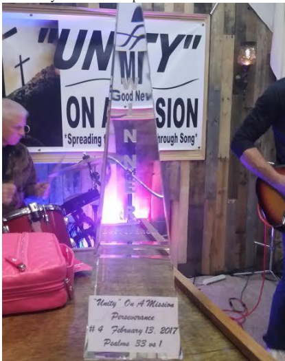
The award given to Unity on a Mission