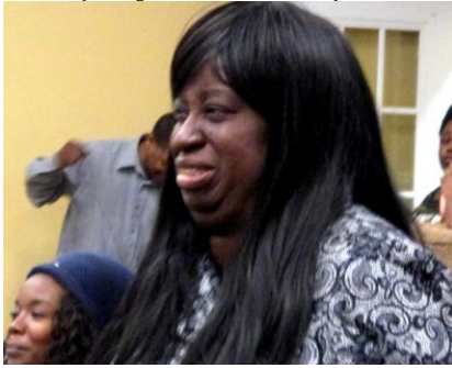
First Lady Theresa Walker

Whole body of Christ endeavors to do just that, to align a group of believers from all different walks of life, weaved into a unification of oneness. We are not replacing the church; we are a paraclete to