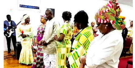
Each person standing in the gap for their area of Ghana

It was the celebration of the birthday of Ghana and it was a amazing experience to be in service with