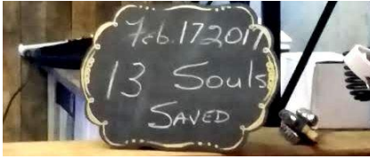
The scoreboard: God 13, Satan 0

have to get in the business. Ask God to make you a soul winner. I used to practice in my home, in my car, everywhere. I used to save everything in the house - the spoons, the sponges, the towels. I can now leave someone to Jesus because it is in my heart.