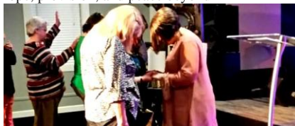
Prayer over people