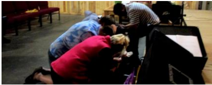
Crying out to God