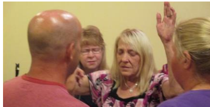
People were prayer over