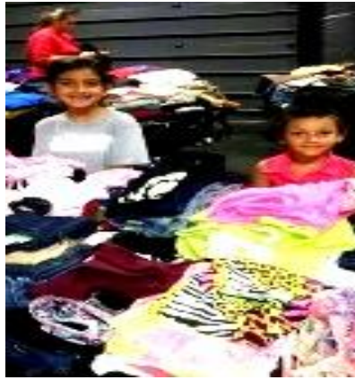
Some of the people