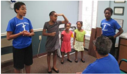
The children's ministry opened in song.

instead of in faith and hope. Faith opens up the door to the invisible. It is that set of eyes that lets you see into heaven. The Spirit is the highest love God gave us. We want to take you directly to the Spirit so that the Spirit is engrafted in you. We are now part of the Whole Body of Christ Alliance.