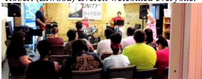
The praise and worship begin.