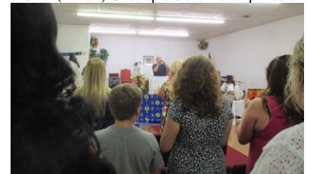
The people in worship