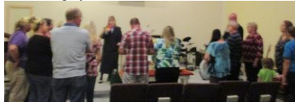
All those gathered in the front to commit to working for unity.

“When God gives those gifts, he doesn’t take them back, but they can lie dormant. I Cor 13, if you have all this, but have not love, you are just a tinkling cymbal. We have to soak it in love.