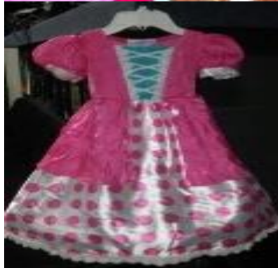
The cutest little dress