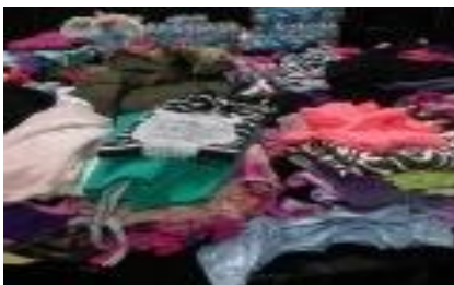
Stacks of the clothing for kids