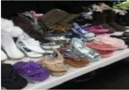
Some of the shoes

bless those who are less fortunate. There are so many families in the community who live on a