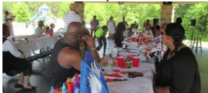
The people and the food