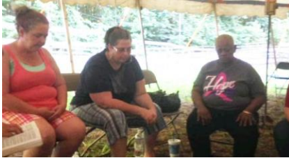
People who pray

because the prince of the kingdom of Persia intercepted the answer. In Daniel 10:13 The Angel Michael interceded in the spirit realm. The spirit realm, where spiritual warfare is fought, where the angels and demons are fighting over your prayers. Angels are agents that intercept our prayers, engaging with demons in the spirit realm. This is what is referred to as 'heavenly places.'