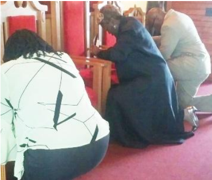
Praying at Smith Memorial

as he sewed, some fell by the way side, and the fowls of the air came and devoured it up. And some fell on stony ground, where it had not much earth; and immediately it sprang up, because it had no depth of the earth. But when the sun was up, it was scorched; and because it had no root, it withered away. And some fell among thorns, and the thorns grew up, and choked it and it yielded not. And the other fell on good ground, and did yield fruit that sprang up and increased; and brought forth, some thirty, and some sixty, and some an hundred. And he said unto them, He that hath ears to hear, let him hear.'