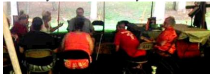
The people of God gathered for prayer and instruction

Wednesday 8 June at the 30-day tent revival