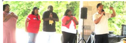
Redemption Church Praise Team

giants who went before us. Call and thank somebody who sacrificed for you to be where you are."