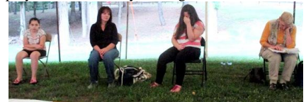
Some who came to pray

prayer and to actually hearing from the Lord.