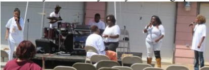
The praise and worship winding down