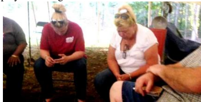
The people in prayer