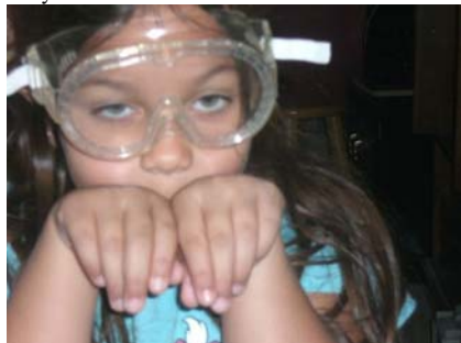
I like the strange creatures in Bible Knowledge

12: What king of Israel had much of his territory taken away by Tiglath-Pileser, the king of Assyria?