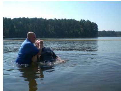
I become completely immersed in Bible Knowledge

14: What king of Israel experienced a long famine and drought during his reign?