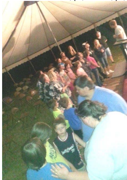
One night at the revival

There was a tent revival in Braselton from 4 May to 10 May. It was kicked off on Sunday 4 May with a hot dog grill and drinks, with gospel music from 1300 to 1600 (4pm). At 1900 (7pm)