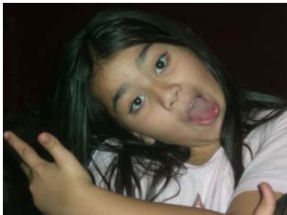
Guess I better read the Bible some more