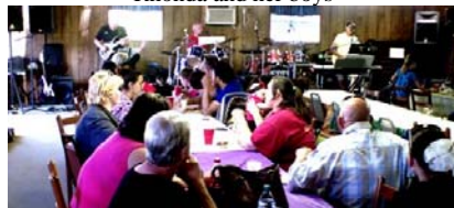
People enjoying Rhonda's Coffee House

Come join us at Rhonda's. The next one will be on 2 August at 1800 (6pm) at the Fairview Community Center on Fairview Road off Hwy 60 in Braselton, Ga.