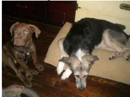
I'm bored, let's look at the Bible Knowledge

5: What king of Judah showed mercy when he executed his father's murderers but spared their families according to the Law of Moses?