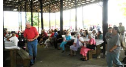
Some of the people at the concert