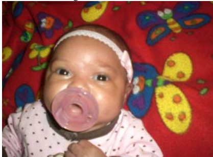
I cut my teeth on Bible Knowledge