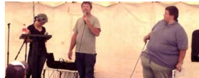
After the revival was revived