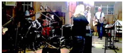
Unity on a Mission