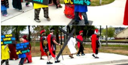
Jesus on Jackson Street