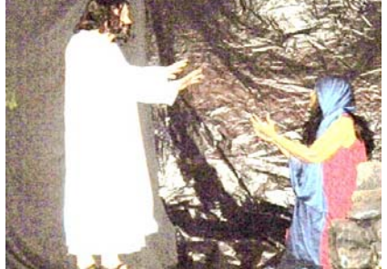
Jesus comforts Mary with his presence. "Do not cling to me. I have not yet ascended to my Father. Go, tell my brethren I go to my Father and your Father, to my God and your God."