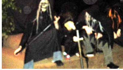
A group of demons congratulate each other after the death of Jesus