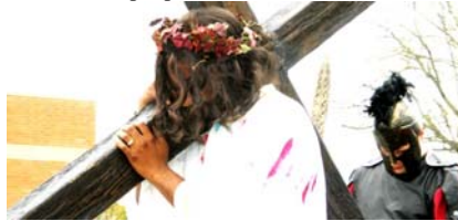
Flogged as he walks