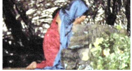
Mary of Magdala weeps bewildered when she sees the empty tomb