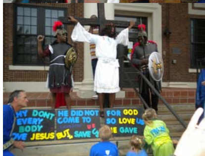
The procession ended at the courthouse in Winder