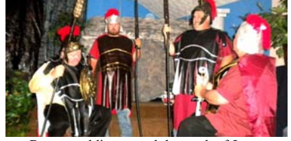
Roman soldiers guard the tomb of Jesus