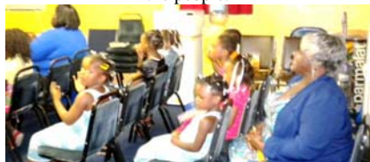
The many children sitting together