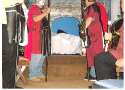
The stone is rolled away and the guards become terrified