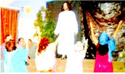
Yeshua appeared to more than 500 people after being resurrected. The people worship him.

After seeing her Lord Yeshua, Mary of Magdala ran to tell the disciples of him, yelling, "He's alive! He's alive!"