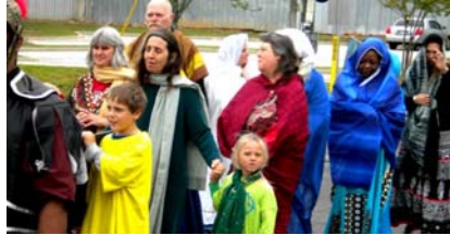
The people of Jerusalem watch

Fellowship, Heaven's Gate Ministries, Iglesia Aliento de Vida, and others.