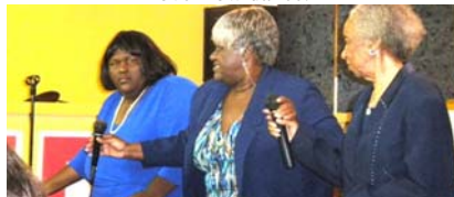
Music from Life Tabernacle

"The devil is a liar. If I trust in God, it will work.