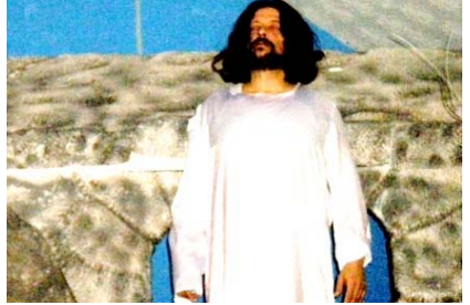
Yeshua rises from the tomb and praises the Father