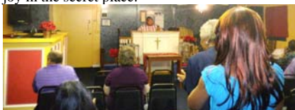
The Minister and MC Tyrone Phillips addresses the people.

(from pg 9) by God. When you're driving your car, you wanna be by God in the secret place. You feel joy in the secret place.