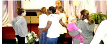
Introductions and fellowship