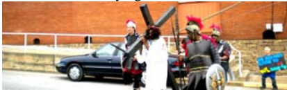
Down the Villa Dolorosa