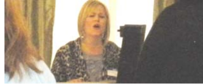
Floating on a cloud of deep worship