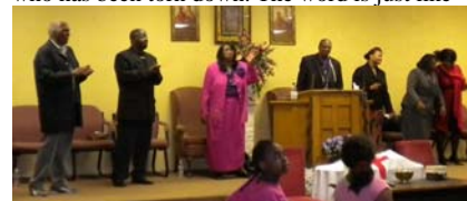
Those on the pulpit

His ministry was uprooting and planting. Sometimes things will be torn down. When God sends a word, it will bring life back to someone who has been torn down. The word is just like