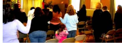
Women in worship