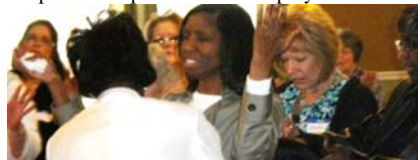
Prayer over people