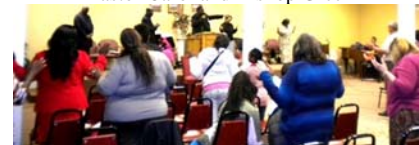
God’s people in worship