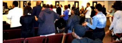
People in worship