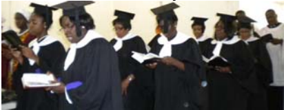
The choir processional marching to the front

“V 26 says your carcasses will be food for the birds and that no one will frighten them away. People hanging from trees that looked like you and me fit that description. These things come on us because we are the body of disorder.