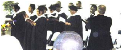
The choir in place