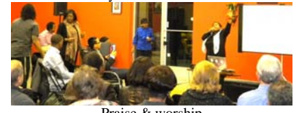
Praise & worship