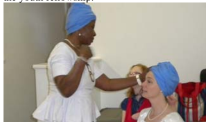
Women’s Fellowship members

Between Sunday school and the service is break and fellowship. On the first Sunday of the month everyone dresses in the uniform of their particular ministry. For instance, The women in the blue turbans are those in the women’s fellowship, and those in the white ones are in the youth fellowship.