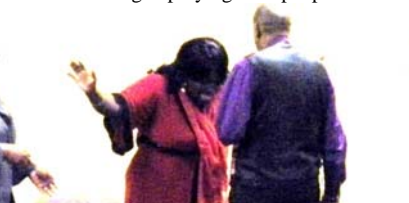
Sister God has a miracle for you. He says he's turning it around.