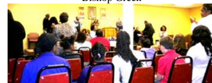
People hearing, reacting to the word