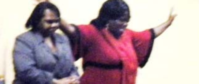
An interpretation to the prophecy was given.