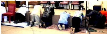
Altars filled with Herschel’s preaching