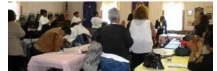
Grateful women applauding

"The devil wanted to kill me through depression, sex, drugs, but God is able to change you. I was shacking with a man, and his momma said, 'Do you know Jesus?' She told me about him and I began to fall (cont. on pg 8)