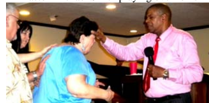
Prayer over people