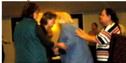
Prayer over people at the end of service

"My question to you is this: What is it that you heard tonight?"