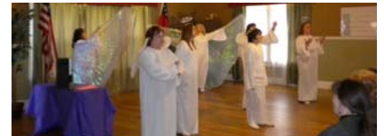
The drama team from Walk on Water Ministries