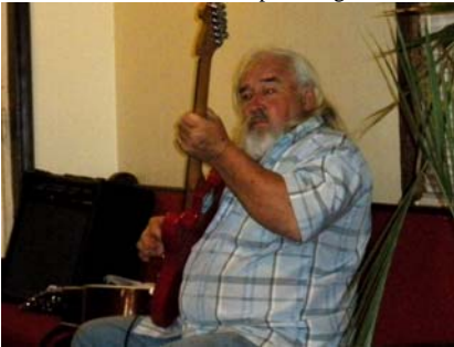
Incredible blues guitarist

"John 1:1 – 'In the beginning was the Word, and the Word was with God, and the Word was God.' The Word was made flesh and walked among us and he said, 'My words are spirit and life.' How did Lazarus get up from the tomb? The Doctor does not have the final word. Whose report will you believe? God has the final word. My uncle had lung cancer and the doctors said he had only 6 months to live. I was sending him CDs and he was getting the word. He got saved and 6 years later he died of an aneurism, not cancer. Doctors can't tell you how you'll die, unless you listen to them. It is the same with the devil if you listen to him. My uncle never had chemo or surgery. He believed God's report. If God said it, he'll make it good.