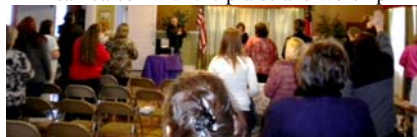
Women in worship

"What is the significance of the scraps in 2014? In Mat 14:15, Jesus saw the executive board coming (the 12) and he said to them, 'What you got?' He knew there were about 15,000 people. So, he took inventory. He looked at what we do have, not what we Don't have. He had them sit in companies of 50 and 100 and that takes time. He broke the bread and blessed it, and the disciples lost count at this point. It is the breaking. Every time you got broken you went to desperation, and your desperation became devotion. There is a place that breaking will take you.