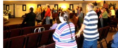
People in worship