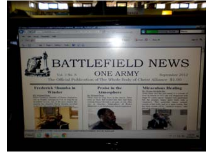
Battlefield News website

The Battle field News has a website. It may be found at WWW. Battlefieldnews.Net. The Whole Body of Christ Alliance site may be found on Face Book, as well as on U-tube.