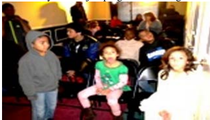
Some of the kids before the service