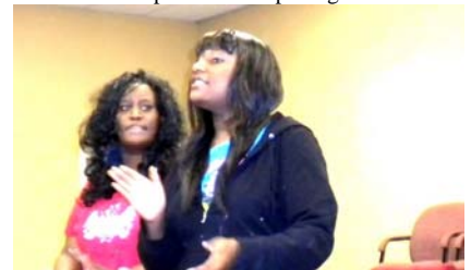
Second Generation was the opening performance.