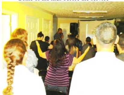
People in worship