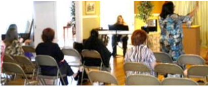
Women in worship

I was using a pay phone at night in July of 1985 and a stranger approached me to ask directions. I was rather rude to him. He was a big man. I watched him as I argued over the phone with my drunk sister, trying to get her to come home. I turned my back on him and the next thing I knew I had a hard object against my head and he spoke to me mean and filthy. He told me every vile, nasty thing he would do to me. He took me under an abandoned house and poked me in the eyes so I would keep them closed. He told me all the vile things he was going to do and then he would kill me. He forced me to undress.