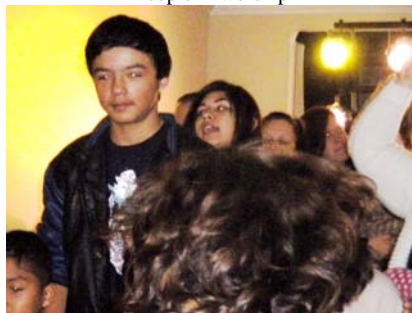
Kids in the front in worship and others in the back