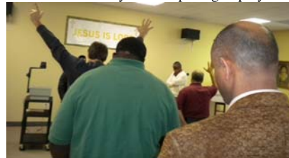
Men in worship