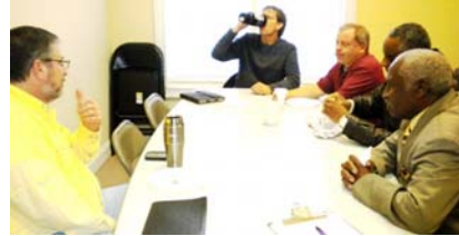
Men at the breakfast table before the conference

to search out a matter. If you tell your son, 'Ok, you want the bike. How can you help me run the house? He will search it out. God wants to do kingdom business first (Mat 6:33). In the kingdom, every joint fits together. You can't operate without all the parts in place. We all have intended purposes.