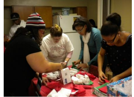
Preparing for the people at the center