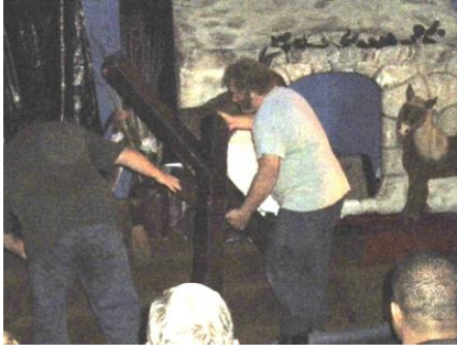
The two men lament that they had to use the wood to build a cross

The 3 rd tree begins praising God and shares, "It's been about 3 1/2 years since my last friend was cut down. I miss them, but I just want to stand straight and tall for you, Lord." Two men show up and cut the tree down.