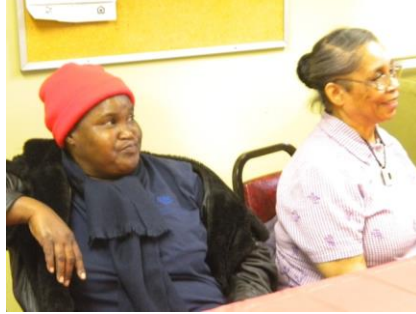
Residents of the Ft. Yargo Apartments