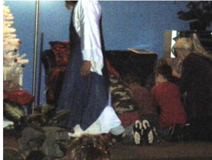
Jesus shows up as the kids pray to receive him.

Grandma asks, "Did ya'll enjoy the story? It's not really the end of the story. It's the beginning." Disinterested Zack has become very interested, "That was way better than a video game." All kids kneel with Grandma to receive Christ.