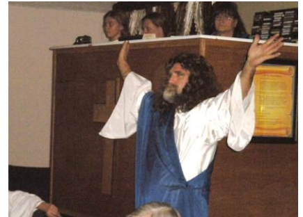
The King of kings enters

Two of the 3 trees are left and they speak. The 2 nd tree addressing the 3 rd tree says, "Well, it's been about 30 years since they cut our friend down. I'm tired of being here. I'm ready to be out on the sea." The two men came back to select another tree. They cut down the 2 nd tree. They build a small fishing boat with it, not a large ship. The tree can be heard weeping, "Oh no, a fishing boat. What about all the important people that would ride in me?" The angel reassures the tree that God has chosen him for the King of kings to ride in. Just then Jesus asks permission to stand in the boat and teach the crowd. The tree thanks God.