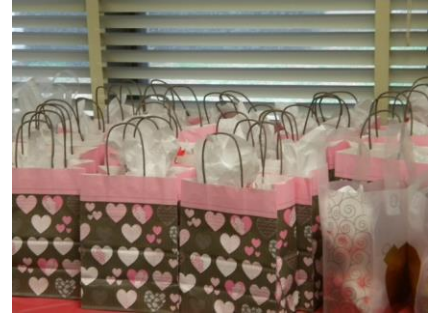
Gift bags for the folks at the center