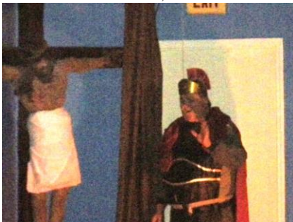
The centurion testifies and sings

A centurion testifies after the crucifixion, "The man on the cross, He looked at me with such compassion. He forgave me. The centurion sang When He was on the Cross, I was on His Mind.