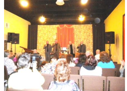
The Unity Quartet at Living Hope

On 12 January the Unity Quartet performed at Living Hope Christian Fellowship in Hoschton, Georgia