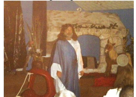
Jesus stands in the little fishing boat and teaches