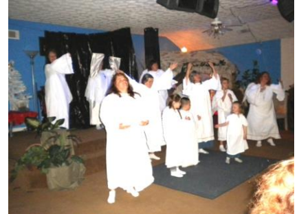
The heavenly host at Christ's birth

Two of the 3 trees are left and they speak. The 2 nd tree addressing the 3 rd tree says, "Well, it's been about 30 years since they cut our friend down. I'm tired of being here. I'm ready to be out on the sea." The two men came back to select another tree. They cut down the 2 nd tree. They build a small fishing boat with it, not a large ship. The tree can be heard weeping, "Oh no, a fishing boat. What about all the important people that would ride in me?" The angel reassures the tree that God has chosen him for the King of kings to ride in. Just then Jesus asks permission to stand in the boat and teach the crowd. The tree thanks God.