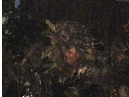
The third tree wants to stand for God always