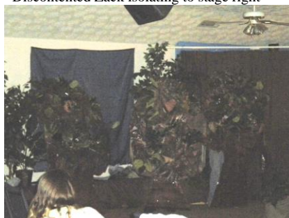
The three Trees