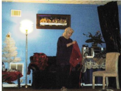
Grandma gets ready for the grand kids

"The story is The Three Trees. Let's go outside and look at the trees while I tell you the story." Three trees growing near one another began talking about what they loved about being in the forest and what they wanted to become.