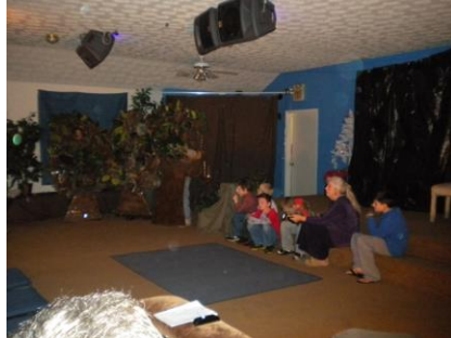
Grandma and the kids with the 3 trees story