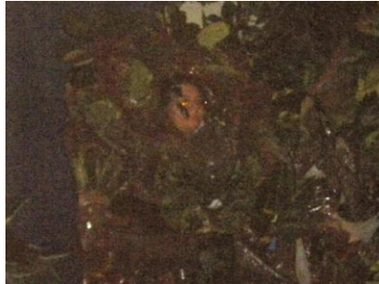
The second tree wants to be made into a big ship

Just then two men showed up in search of a special tree, and upon inspection decided to cut down the first tree, the one that wanted to be made into a big fine house that a king might dwell in. The next scene was the men just finished building a stable with the wood from the first tree.