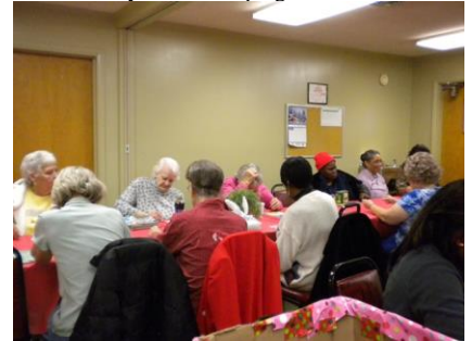
Playing bingo after lunch