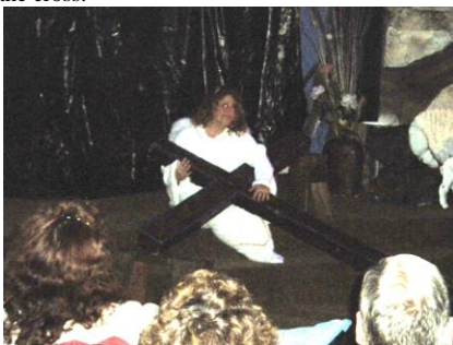
An angel comforts the 3 rd tree.

The tree is made into a cross and can be heard weeping and crying out to God, "Oh God, I'm a cross for someone to die on. All I wanted to do was to stand tall and praise you." An angel appeared and reassured the tree, "God has heard your prayer. The greatest King who ever lived will die on you, but when they lift him up he will draw all men." The men come and carry off the cross.