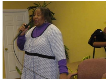
Ain't no party like a Holy Ghost Party