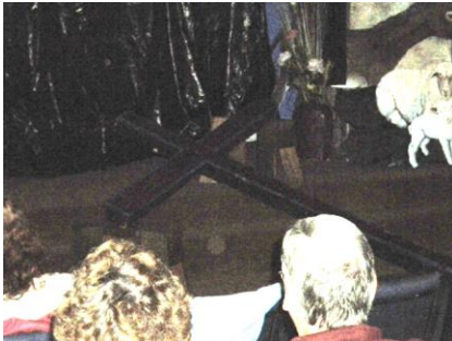
The tree can be heard wailing

The tree is made into a cross and can be heard weeping and crying out to God, "Oh God, I'm a cross for someone to die on. All I wanted to do was to stand tall and praise you." An angel appeared and reassured the tree, "God has heard your prayer. The greatest King who ever lived will die on you, but when they lift him up he will draw all men." The men come and carry off the cross.