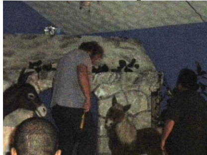
The two men have just built a stable of 1 st tree

The tree could be heard weeping, crying out to God, "I'm a stable with all these stinky animals." An angel appeared and spoke, "God heard your prayer little tree and had chosen you for the King of kings to be born in." The tree rejoiced.