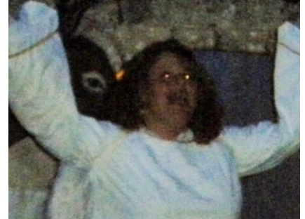
God has heard your prayer little tree

The tree could be heard weeping, crying out to God, "I'm a stable with all these stinky animals." An angel appeared and spoke, "God heard your prayer little tree and had chosen you for the King of kings to be born in." The tree rejoiced.