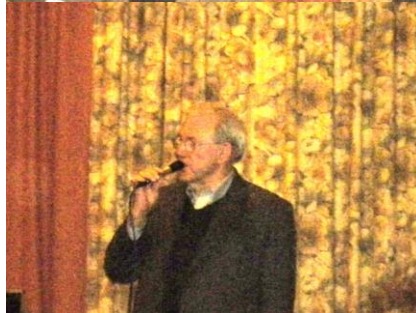
The Unity quartet individually

The concert was fantastic and well worth showing up and trying to get a seat in the crowded church.