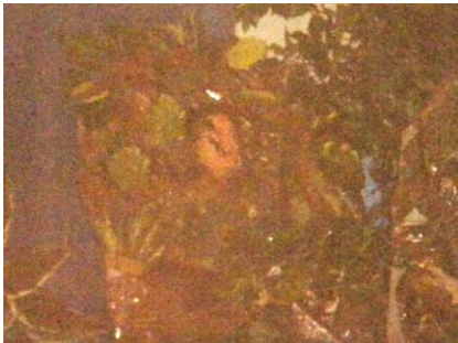
The first tree speaks its wish to be a house

The third tree said, "I want to stand always, and praise God for ever and ever. I want to always stand for God."