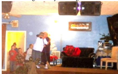
The kids arrive for Christmas