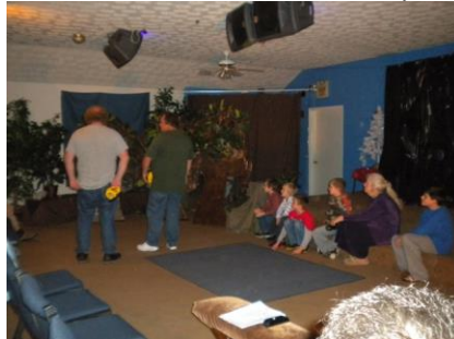
The two woodcutters searching for a tree