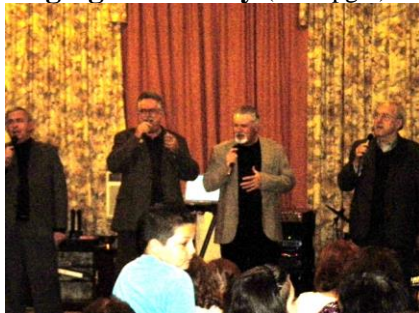
The Unity Quartet at Living Hope