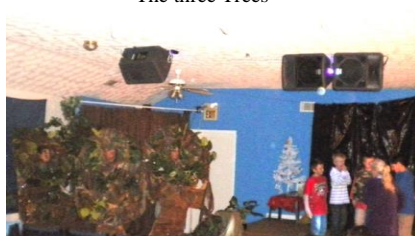
Grandma and the kids in the woods with the three trees as she tells the story. (cont on pg 6)