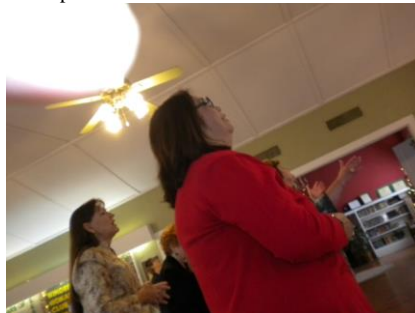
Women in worship