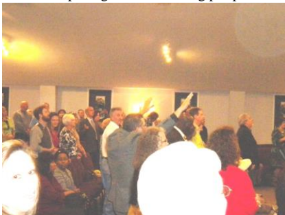
People in worship