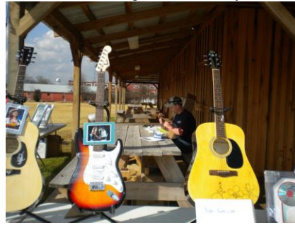
Some of the merchandise for silent auction