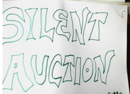
The silent auction sign to raise money for kids

round. “We help about 100 families every year.” Pastor Tuck told BFN.