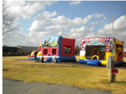
Two moon walk stations