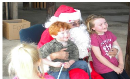
The kids had a great time with the Santa