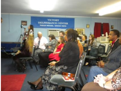
Folks filling up the church

She sang a second song, a definite Country Gospel song, Praise Him .