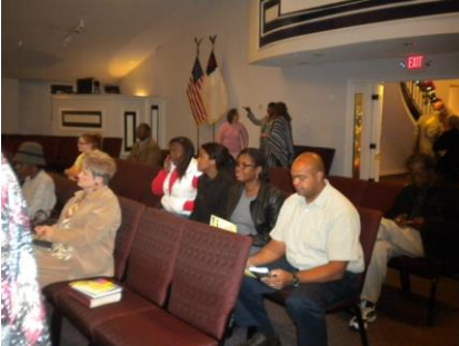
Getting ready for the first Comm. Worship