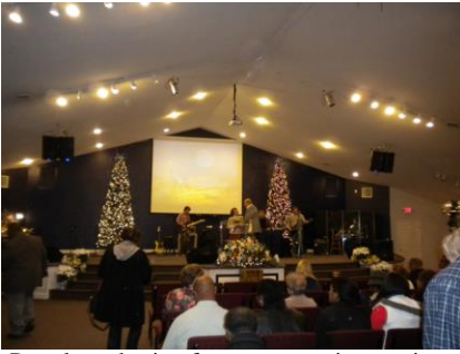
People gathering for a community service