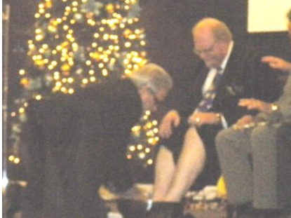
Washing the Bishop's feet as he weeps