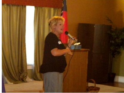
Praise and worship music most excellent

Do you live in Hotel Hell with the fruit of the spirit locked up? Take the keys. No secret will not be brought out before God at the judgment.