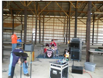
The band Crossfire setting up