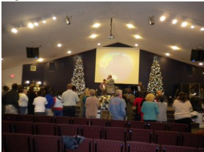
All pastors and ministers were called up front.

“Don’t think that because there are disadvantages to the job you’ve been assigned that God didn’t put you there. Joash had a thankless job. No one thanked him for having the oil for their lamp, they just filled the lamp and lit it. He was probably uncomfortable, he could not light a fire down there. He was probably cold and lonely down there alone. Remember the king put you where you are and knows you can handle it. You must obey the king. Obedience is better than sacrifice.”